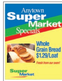
8.5" x 11" Transparency Film